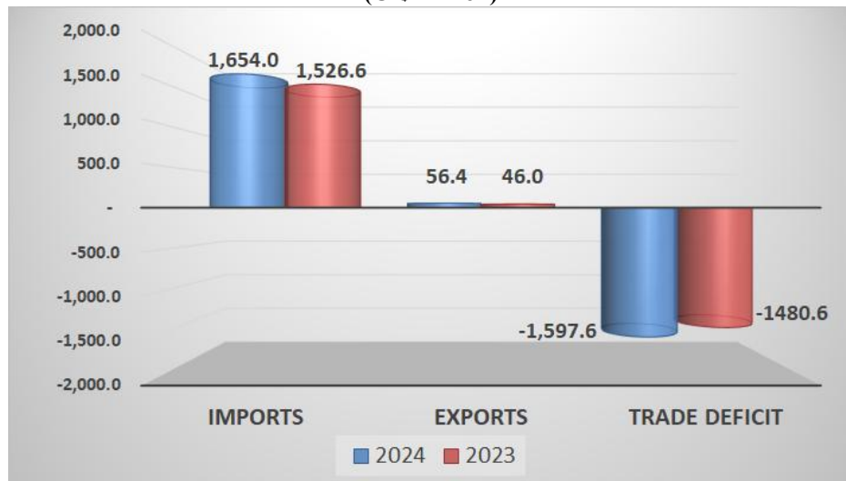
CHART 1: VISIBLE TRADE BALANCE, 2023 AND 2024 (CIS$ million)

The most significant contributors to the trade deficit were: (a) miscellaneous manufactured articles ($-342.5 million); (b) machinery and transport equipment ($-302.7 million); (c) food and live animals ($-284.5 million); (d) mineral fuel, lubricants and related material ($-195.6 million); manufactured goods classified chiefly by material ($-195.3 million) and chemicals and related products ($-127.1 million) (see Table 1.1).