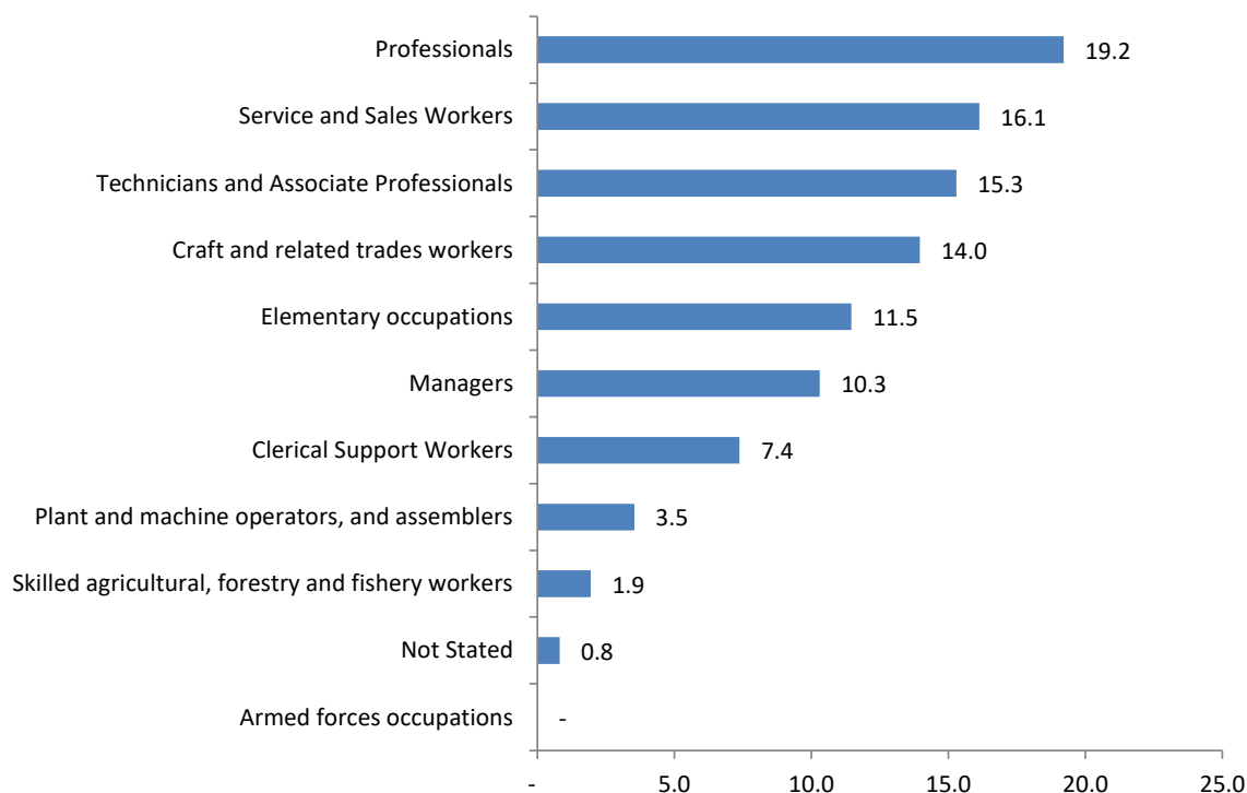
Figure 2: Employment by Occupation Percentage Distribution, Fall 2020

Most employed Caymanians worked as technicians and associate professionals (20.9%), followed by professionals (18.0%); managers (14.5%); clerical support workers (12.0%); and service and sales workers (11.5%). The top occupations for Non-Caymanians were service and sales workers (20.2%); professionals (19.0%); craft and related trades workers (18.9%); elementary occupations (17.1%); and technicians and associate professionals (10.4%). Permanent Residents WRW principally worked as professionals (26.6%); service and sales workers (20.1%); managers (12.2%); craft and related trades workers (11.5%) and technicians and associate professionals (10.1%). (Appendix Table 3.26).