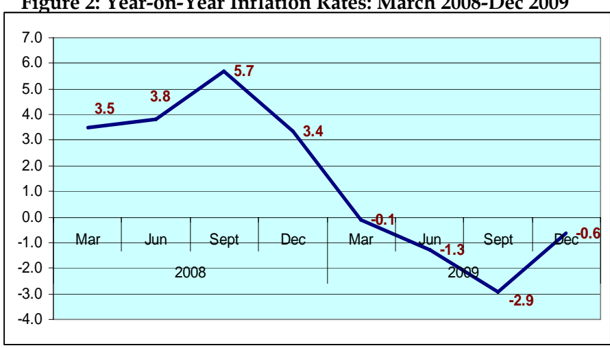
Figure 2: Year-on-Year Inflation Rates: March 2008-Dec 2009

Figure 2 below summarizes the annual inflation rates obtained for the period March 2008 to December 2009<sup>2</sup>.